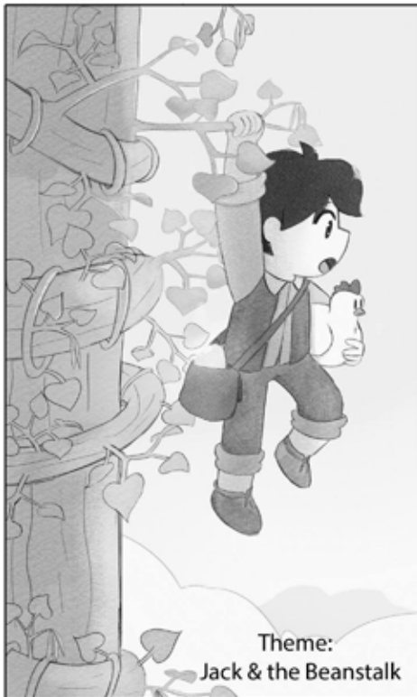
Theme: Jack & the Beanstalk