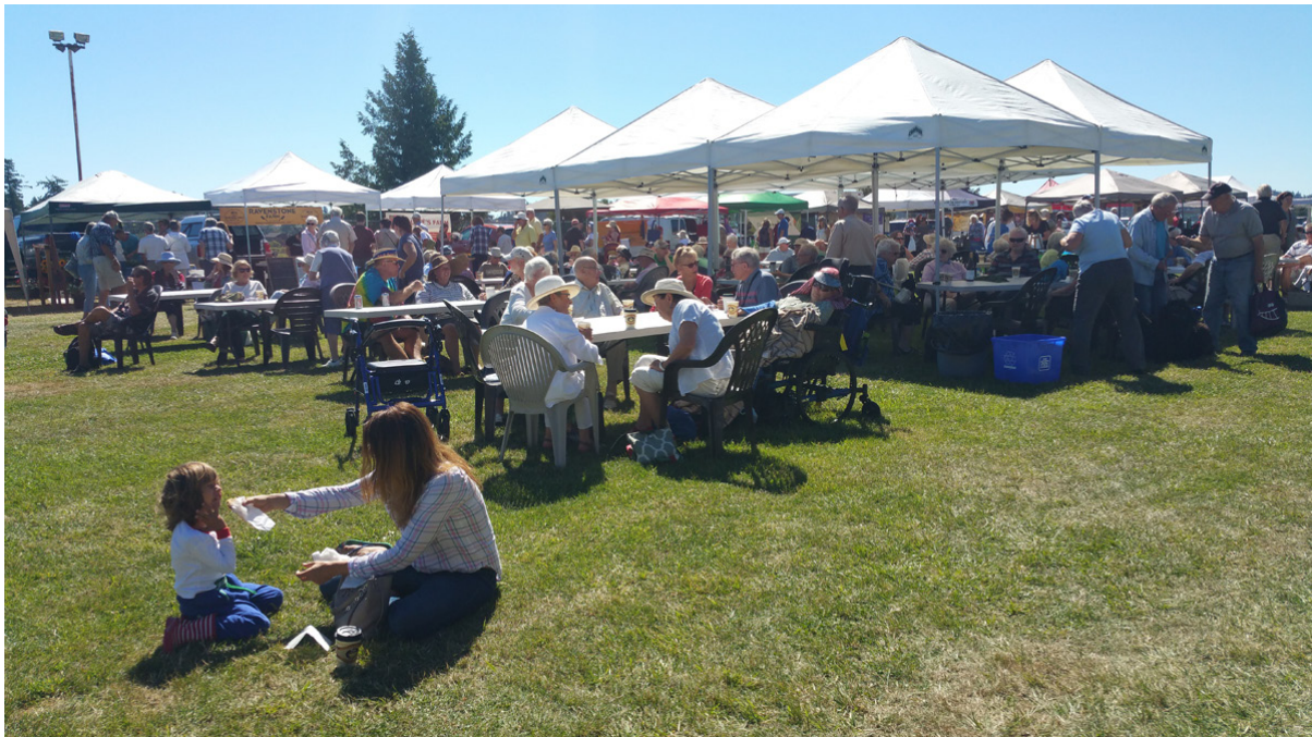
Saturday morning at the Peninsula Country Market.

We have 100 stables available to rent for shows.